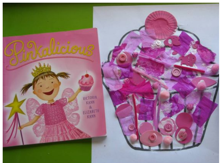
Cupcake template from Learning 4 Kids